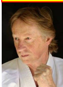
Gary Jackson Karate

Classes in: Karate, Iaido, Jeet Kune Do, Ju Jitsu & Judo